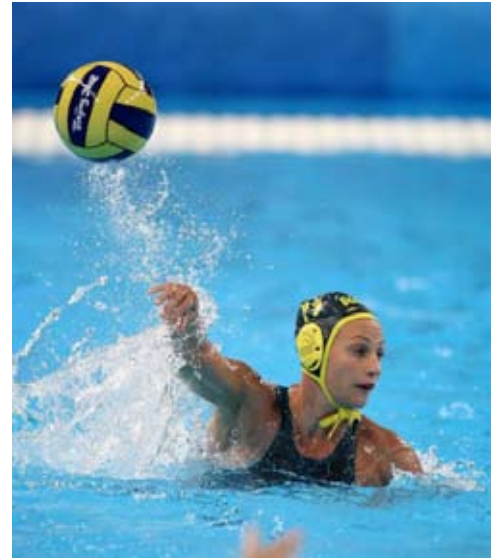
Melissa Rippon in action