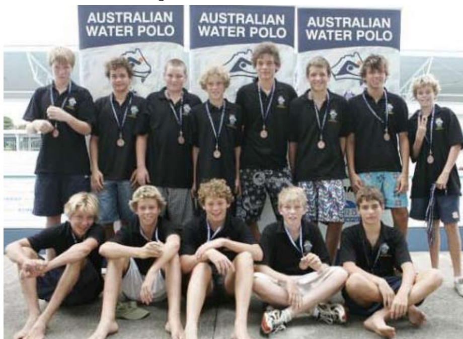
Pictured above - Barracudas U14 Boys receive their Bronze medals at the National Club Championships