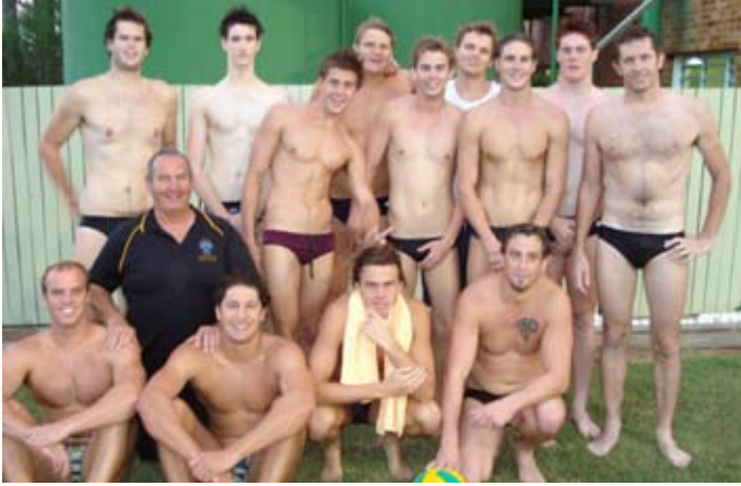
Barracudas Men's A Grade 2007/08 Premiers defeated Sunshine Coast in the BWPI Grand Final (12- 7)