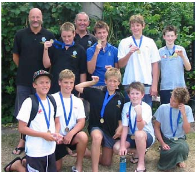
Pictured above the Boys U13 Barras Premiership team with their medals