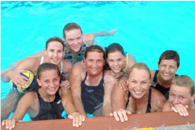
Women's C Grade team (a mix of youth and experience) Runners up in the 2007/08 BWPI Grand Final