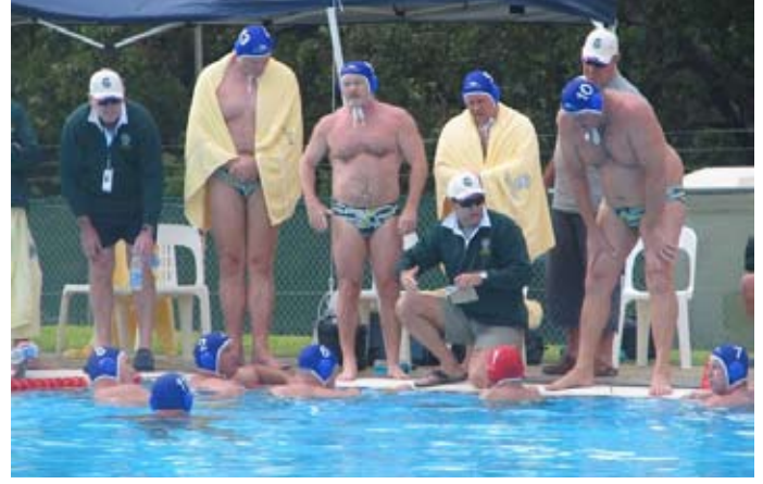
Barracudas +50 Men's team quarter time talk at the XII FINA World Masters Championships