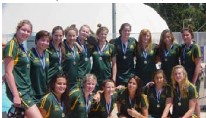
AUS Youth Girls win Silver at Pythia Cup in Greece