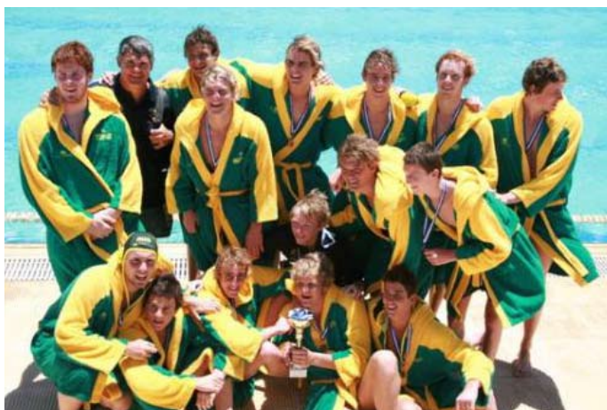
AUS Youth Boys win Bronze at Vikelas Cup in Greece