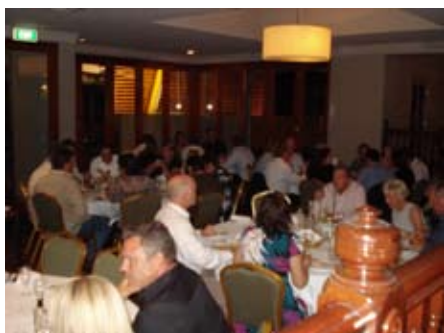
70 Barras club members + guest prepare for dinner at the Piney.